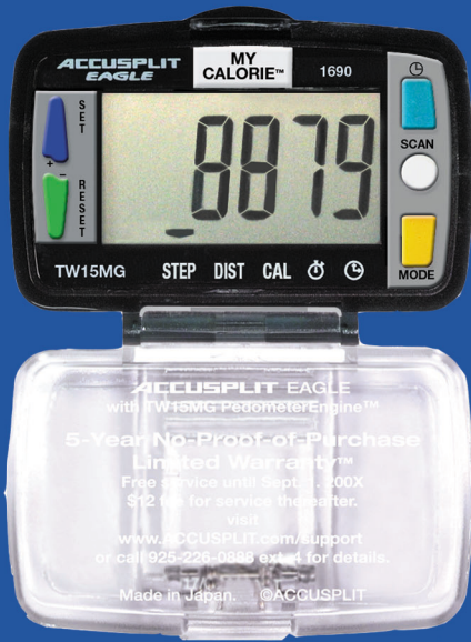
AE1690 Actual Size